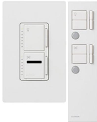
Maestro IR Fan/Light Control

Request: Printed Literature Sales Contact